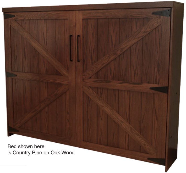
Bed shown here is Country Pine on Oak Wood

Requires standard, innerspring mattress up to 12" thick (not included.)