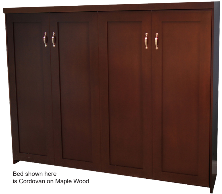
Bed shown here is Cordovan on Maple Wood

Requires standard, innerspring mattress up to 12" thick (not included.)