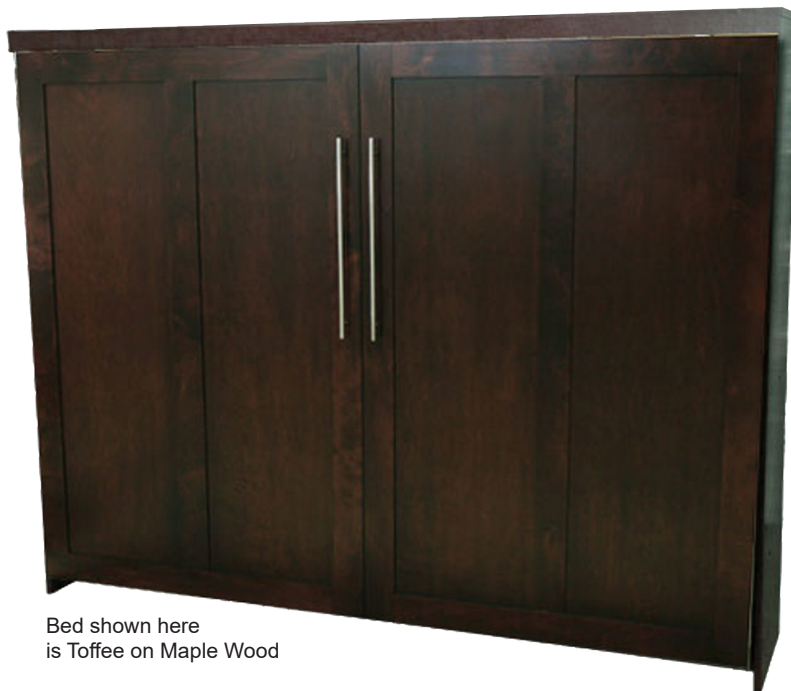
Bed shown here is Toffee on Maple Wood

Requires standard, innerspring mattress up to 12" thick (not included.)