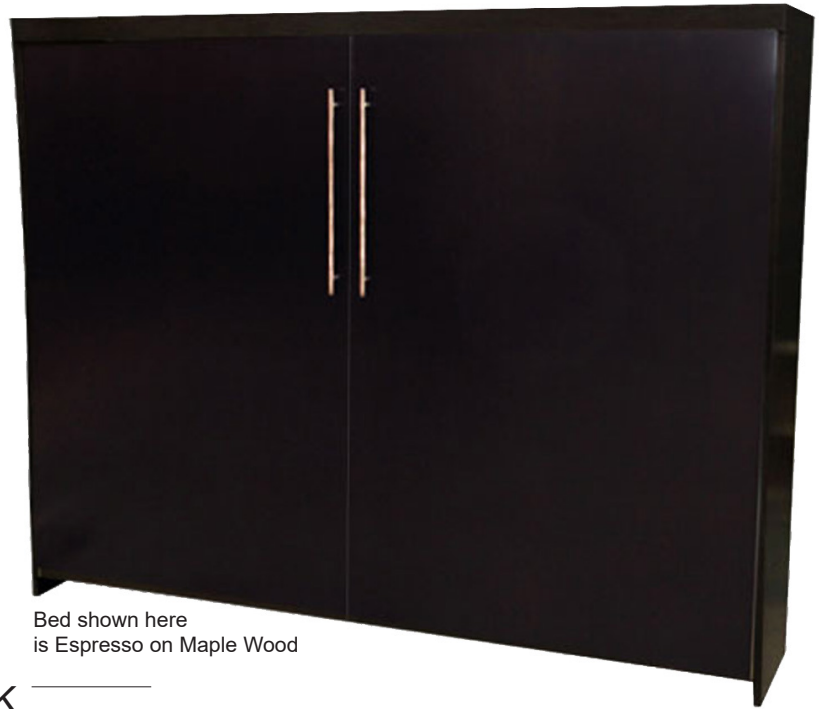
Bed shown here is Espresso on Maple Wood

Requires standard, innerspring mattress up to 12" thick (not included.)