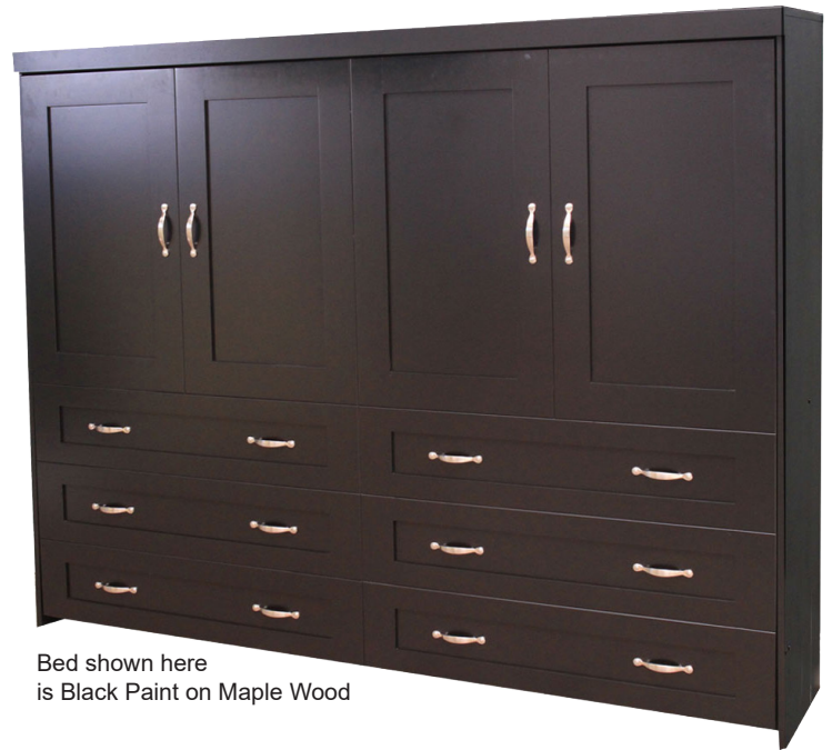
Bed shown here is Black Paint on Maple Wood

Requires standard, innerspring mattress up to 12" thick (not included.)