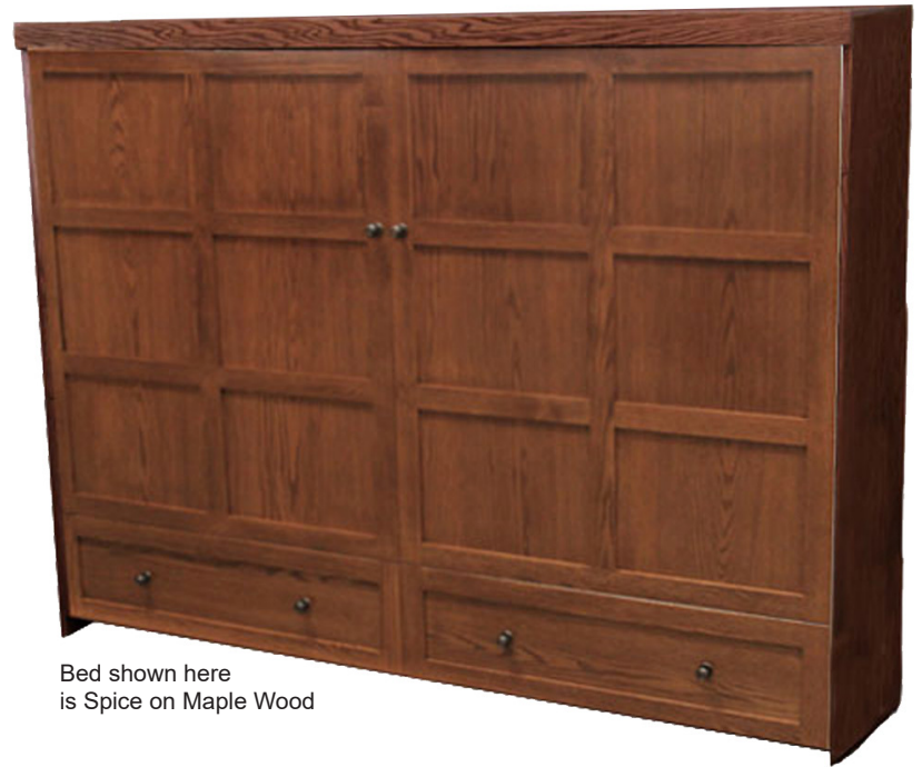
Bed shown here is Spice on Maple Wood

Requires standard, innerspring mattress up to 12" thick (not included.)