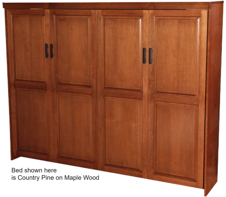
Bed shown here is Country Pine on Maple Wood

Requires standard, innerspring mattress up to 12" thick (not included.)