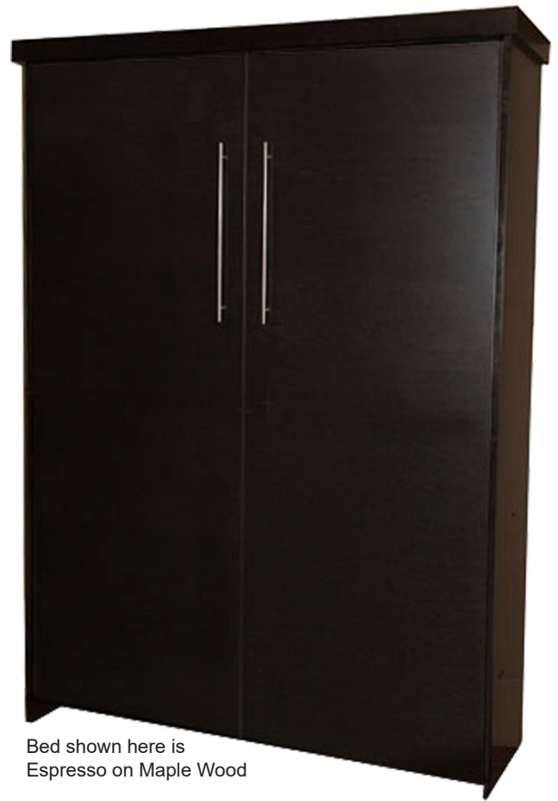
Bed shown here is Espresso on Maple Wood