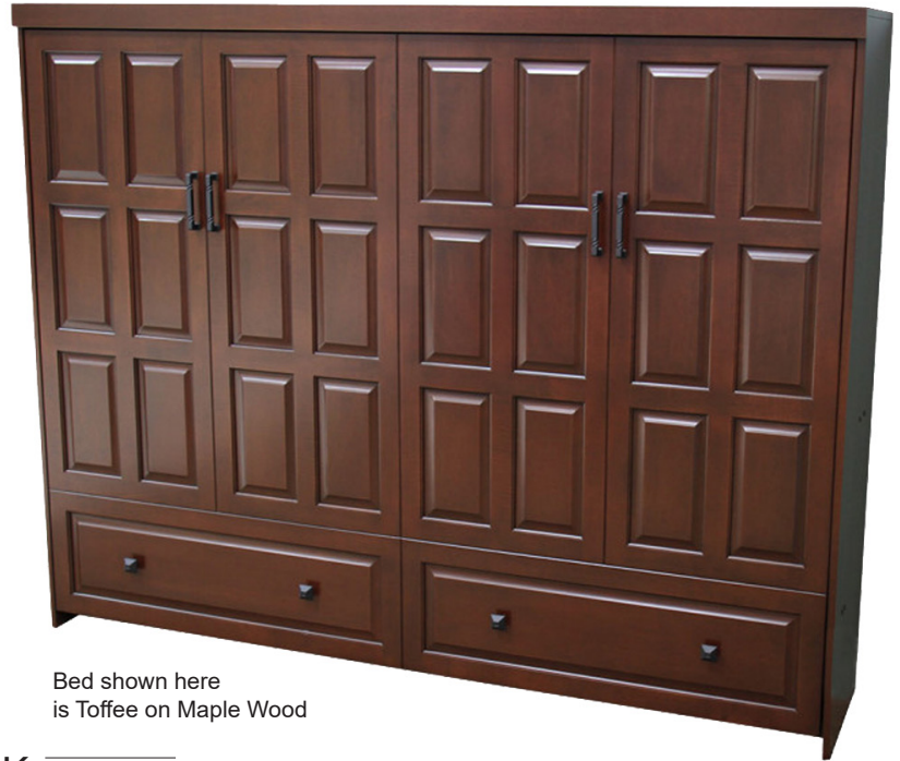
Bed shown here is Toffee on Maple Wood

Requires standard, innerspring mattress up to 12" thick (not included.)