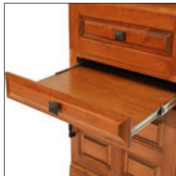
Nightstand Pull Out